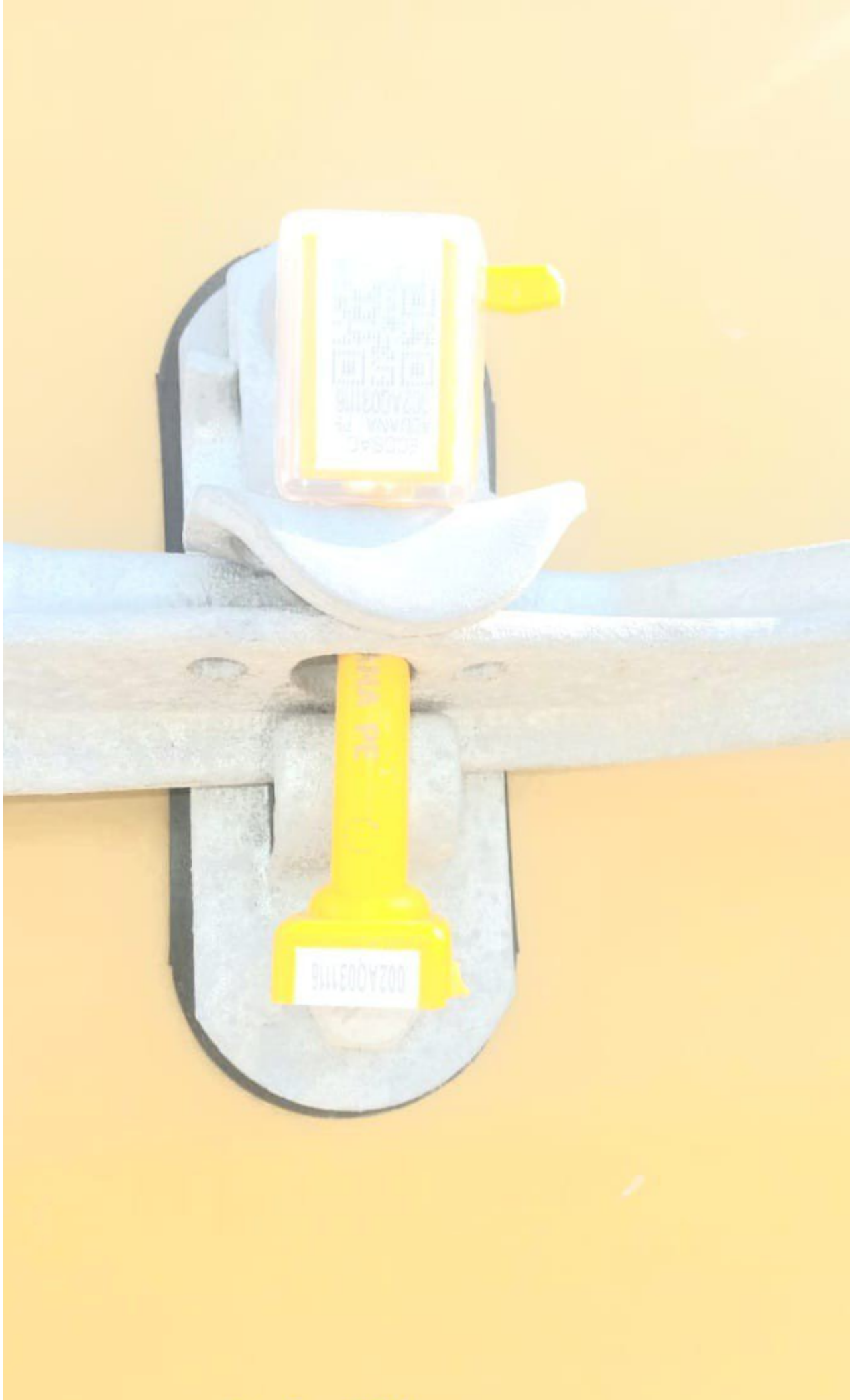
Tomada con mi Galaxy A03s